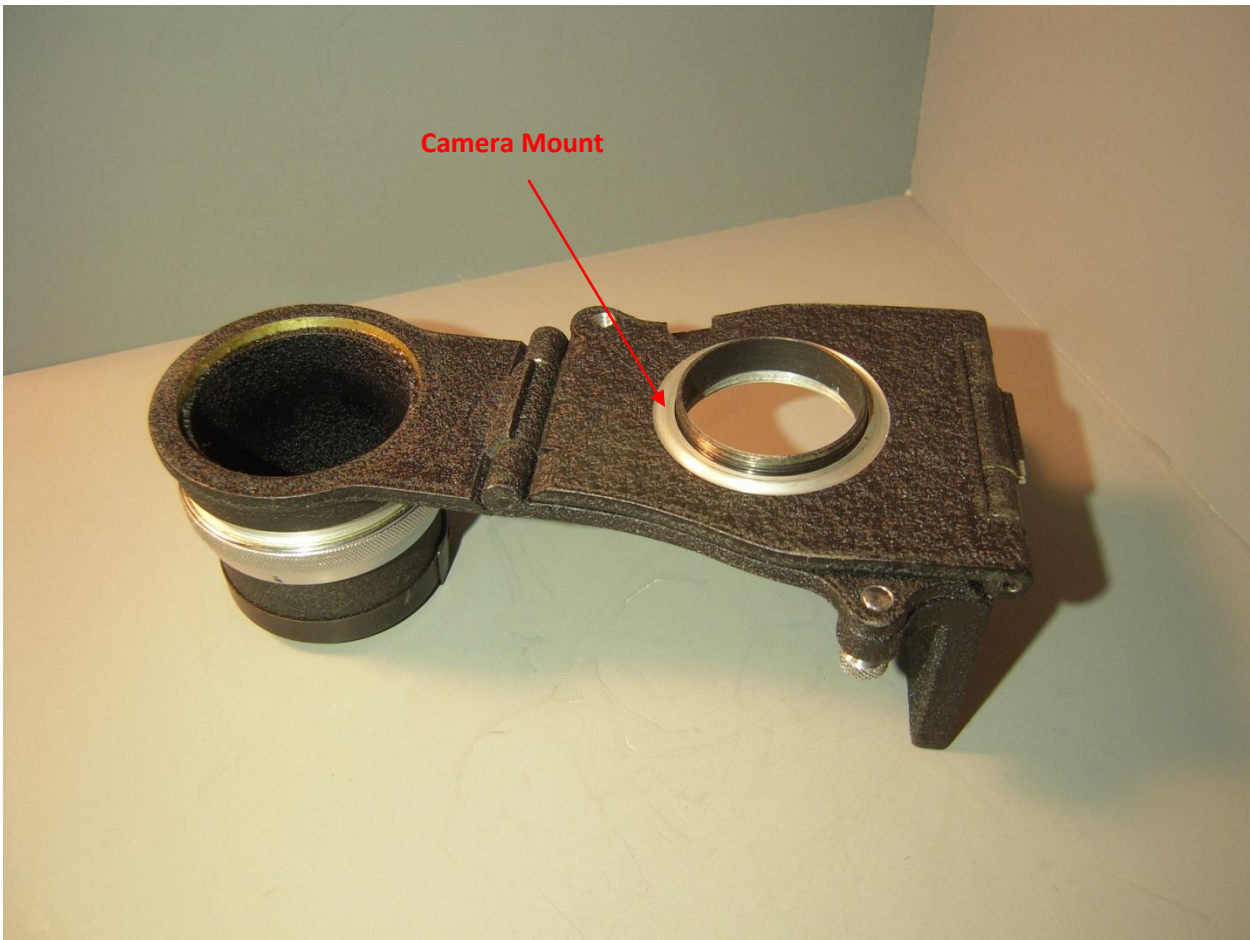
SPEED-O-COPY Bottom View