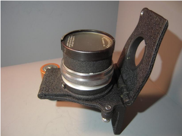
SPEED-O-COPY in Focusing Position 1